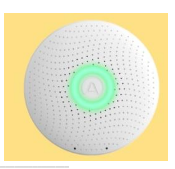
Airthings Wave Mini https://www.airthings.com/wave-mini $79.99

Airthings Wave Plus https://www.airthings.com/wave-plus $229.99