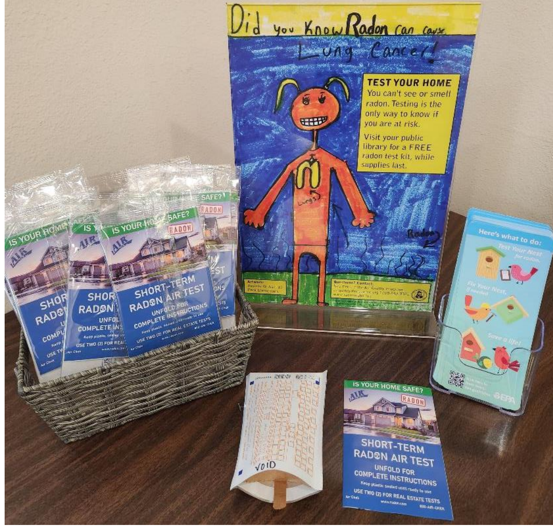
Working on a Radon Device Loan Program